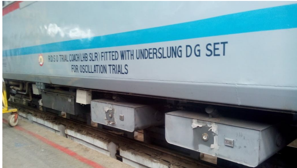
LHB POWER CAR FUEL TANK 1540 LTR. SS – 304