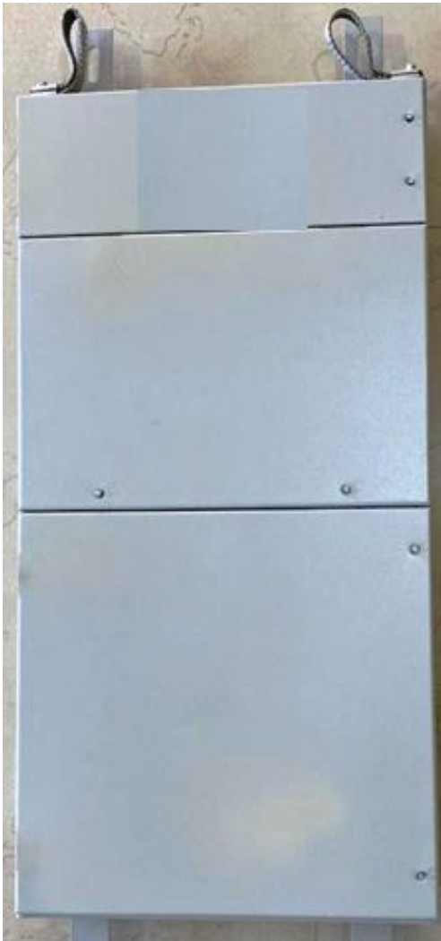
FRONT VIEW ONBOARD LV PANEL SOP-355 REV-1