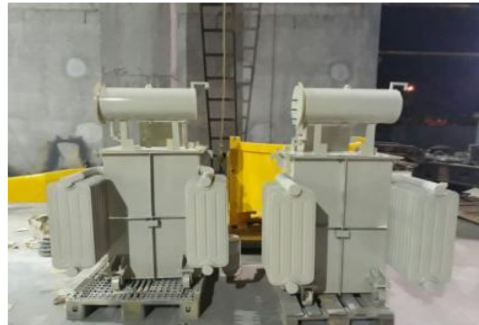
ESP TRANSFORMER TANK